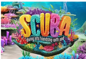
Scuba VBS 2024 Diving into Friendship with God by Group VBS

Saturday, March 23 is the Easter Egg Hunt Kids Fun Fest at John Knox! Join in on the fun with an Easter egg hunt for kids, games, crafts, refreshments, and more. The fun starts at 11:00 AM with the Easter Egg Hunt at 11:30 AM. Event runs until 1:00 PM.